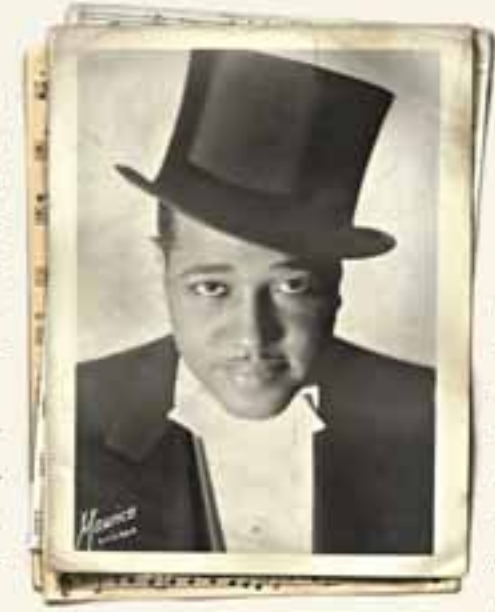
A piane plejun: A compour, An orchostic lieder Duke Ellington ragned over a lond called Jazz

with songs like "Sophisticated Lady," "In a