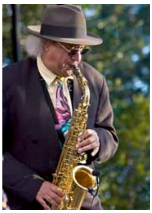
This photo of Gary Bartz captured by Ron Weinstock at the 2008 Duke Ellington Jazz Festival is just one of hundreds of Ron's photos you can view online