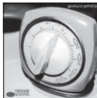
Indigo 4, Gianluca Petrella