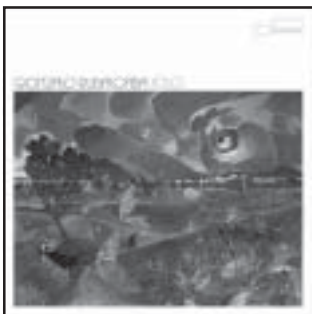
Solo, Gonzalo Rubalcaba