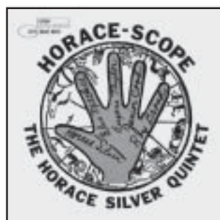
Horace-Scope, Horace Silver Quintet