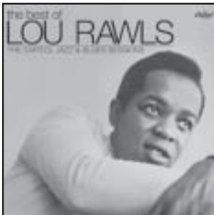
Best of Lou Rawls, Lou Rawls