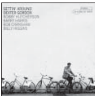
Gettin' Around, Dexter Gordon

From 1953 to 1967, Alfred Lion produced a body of work that ranks as the most innovative series of recordings in modern jazz. Almost all of these masterpieces were documented by the extraordinary Rudy Van Gelder; a self-taught engineer who more than set a new standard. Devoid of caution or timidity, he captured the full power and rich sound of jazz ensembles with dazzling clarity. His contribution to the focused approach that Blue Note took at every stage of any album was immeasurable. Decades later, Rudy agreed to take a second look at the original recordings, bringing them into the digital domain with the same skill and focus. Six more RVG Editions have just been released. If you think you've heard these gems before, listen again.