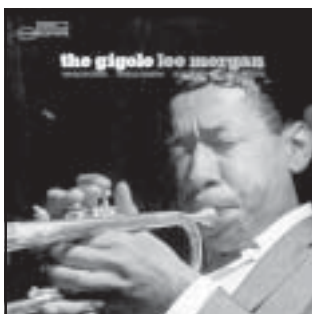
The Gigolo, Lee Morgan