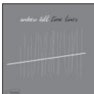
Time Lines, Andrew Hill