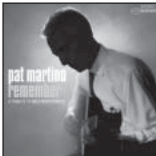
Remember, Pat Martino