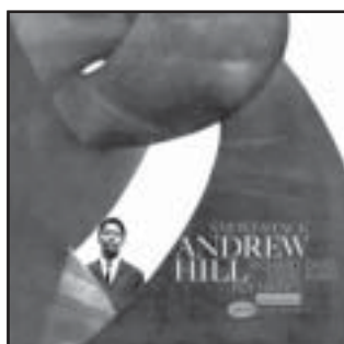
Smokestack