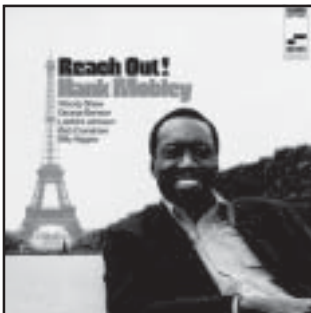
Reach Out, Hank Mobley